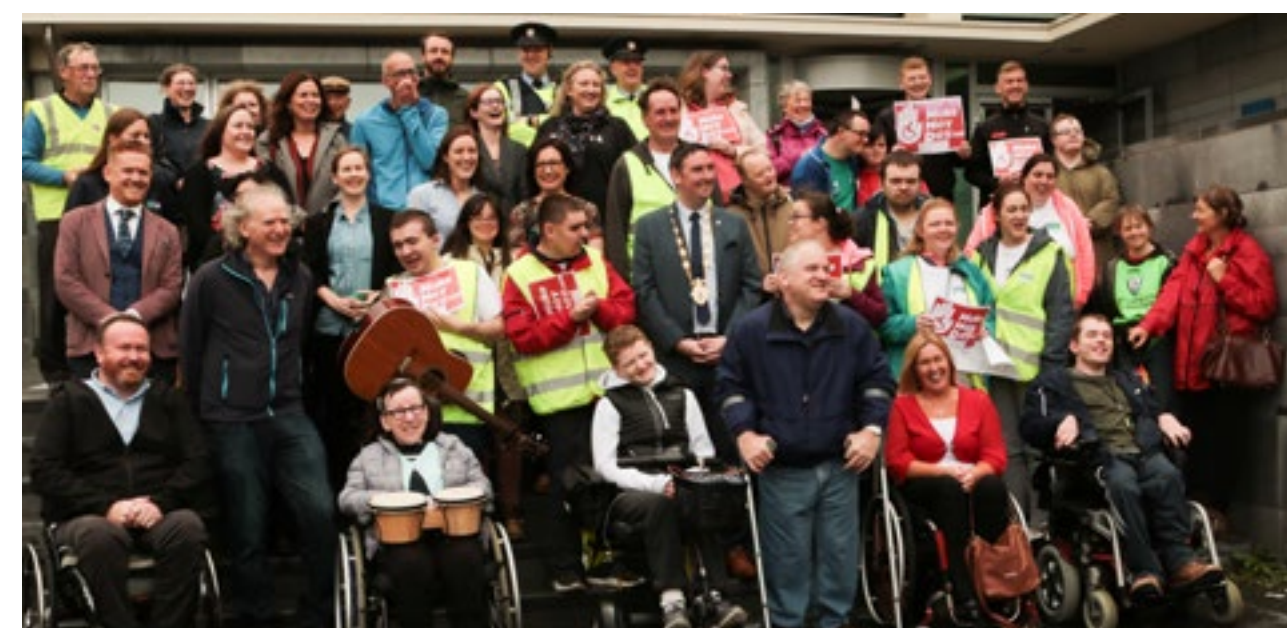
One group of Make Way Day campaigners in Galway city.