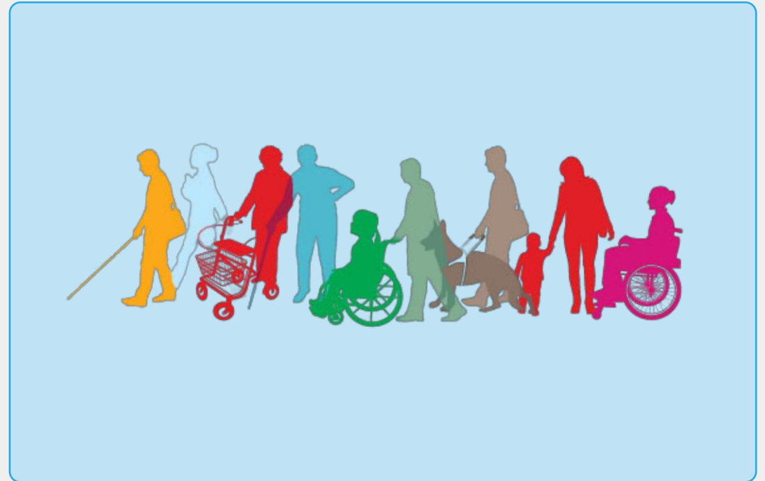
Budget 2027 — The least we can expect

Share these materials with your community, media, and partners, using #TheLeastWeCanExpect #DisabilityBudget27 to get involved.