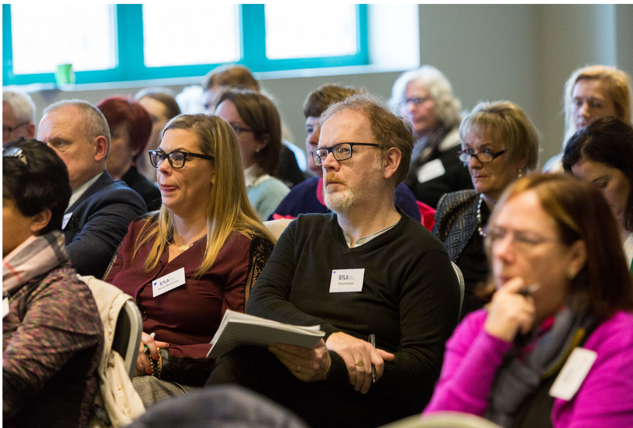
Delegates at SOLA Symposium 2018.