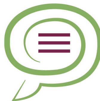
Advocacy & Policy