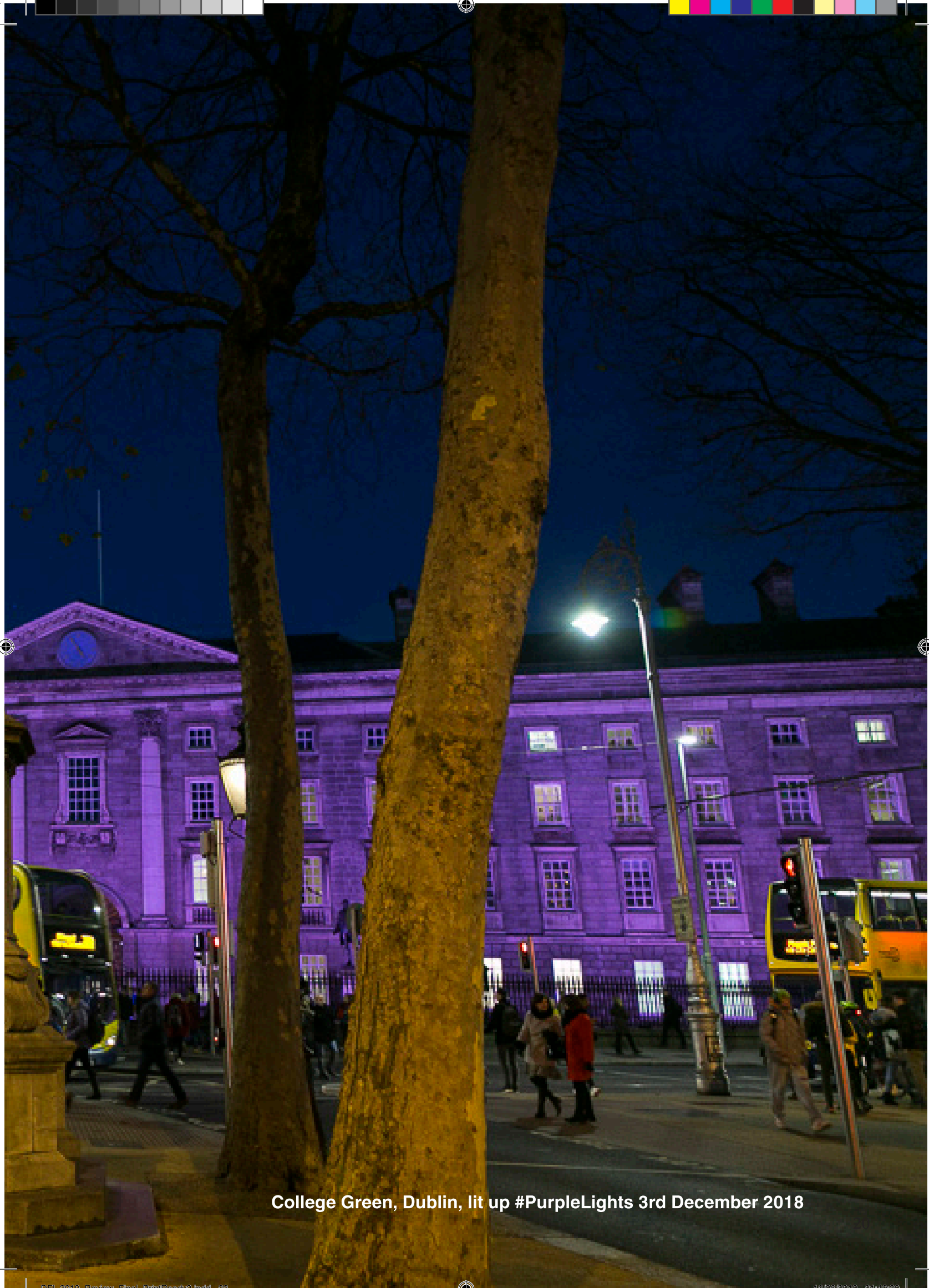
College Green, Dublin, lit up #PurpleLights 3rd December 2018