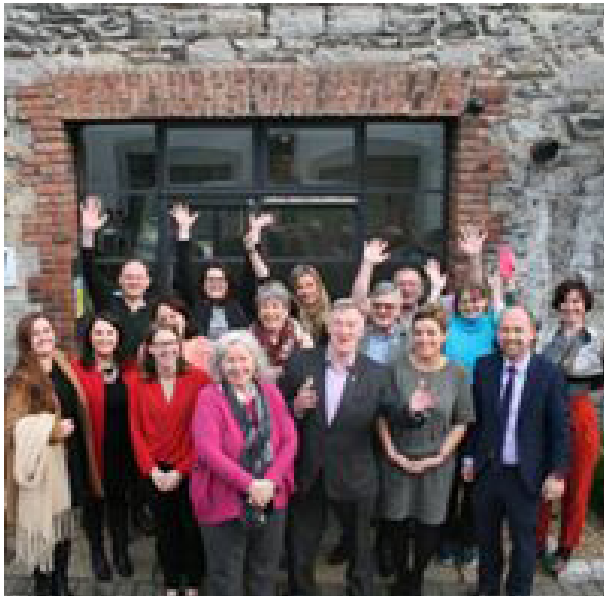
DFI Staff and Board Members outside our Fumbally headquarters, Dublin, September 2018

In a one-off development we agreed to take additional space in Fumbally Court. We now have more space for DFI and our member organisations to hold meetings and we have greatly improved accessibility levels.